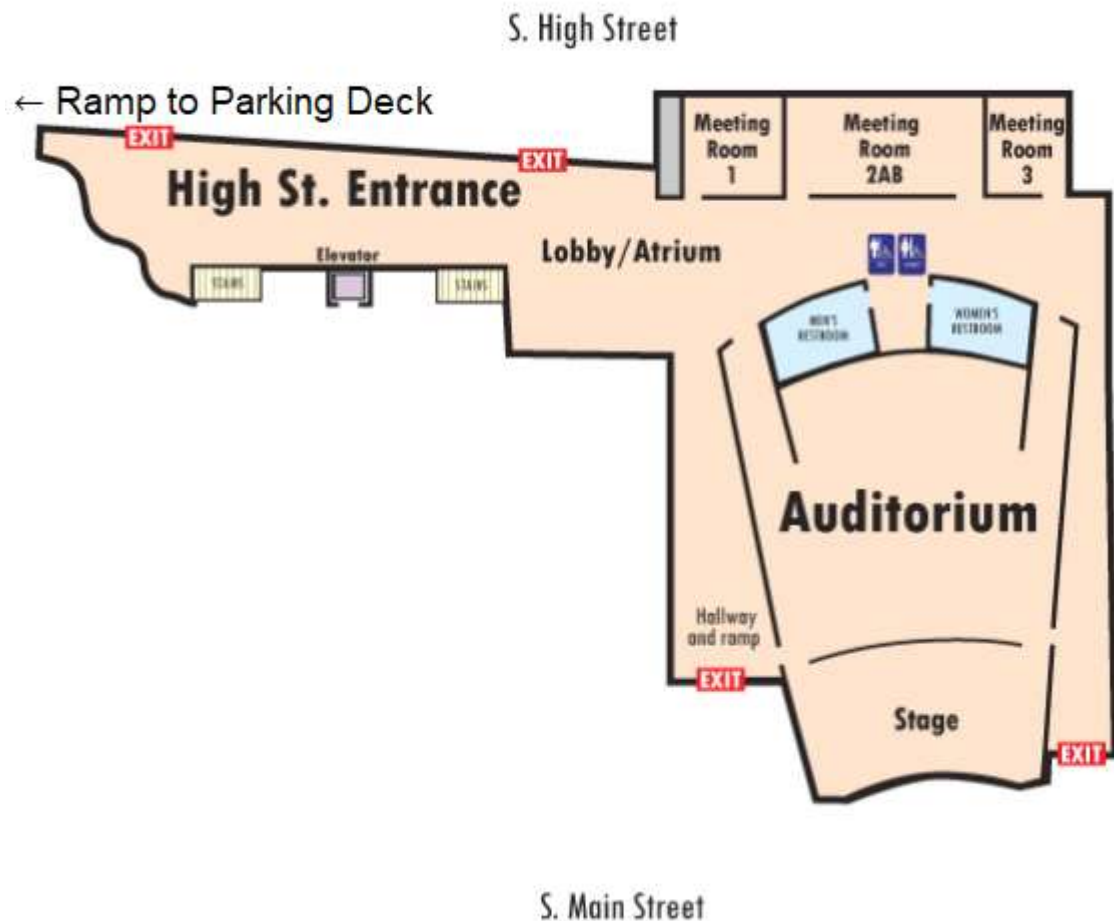
Figure 3: Atrium Floor - South High Street Entrance

You may also take the lower level parking deck elevator up one level and exit onto North High Street. Turn left toward library. Enter the library on your right and turn left to reach meeting room 2AB where the exam session will be held.