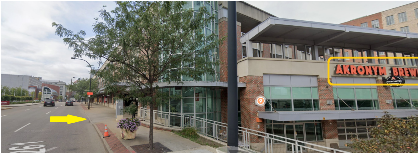
Figure 2: Market Parking Deck

Take I-76 West toward Akron. Exit right at Exit 23B, OH 8 North or Cuyahoga Falls. Exit OH-8 on right at 1B (OH 59 West or Perkins Street). Turn left onto Perkins Street (OH 8 South or OH 59 West) and continue on Perkins for 6 additional traffic lights. At the 6 th traffic light turn left onto North High Street. Just past the 1 st traffic light at Market Street is the Market Parking Deck entrance on the right with free parking for the library.