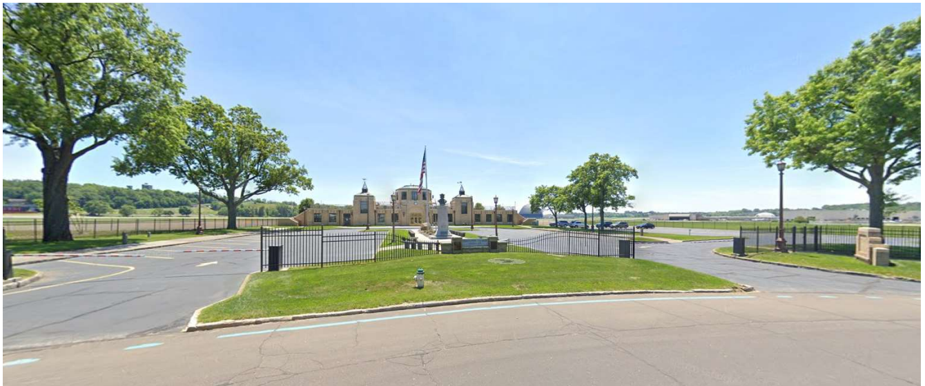
Figure 2: Theken Companies